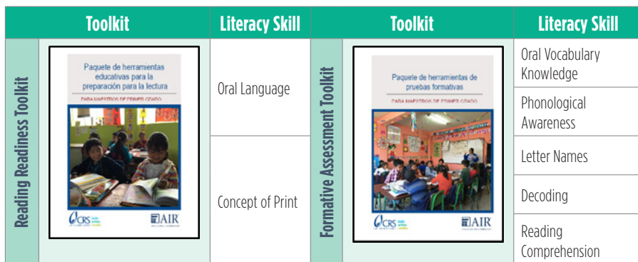
Exhibit 4: Guatemala Bilingual and Lao-language Formative Assessment Trackers