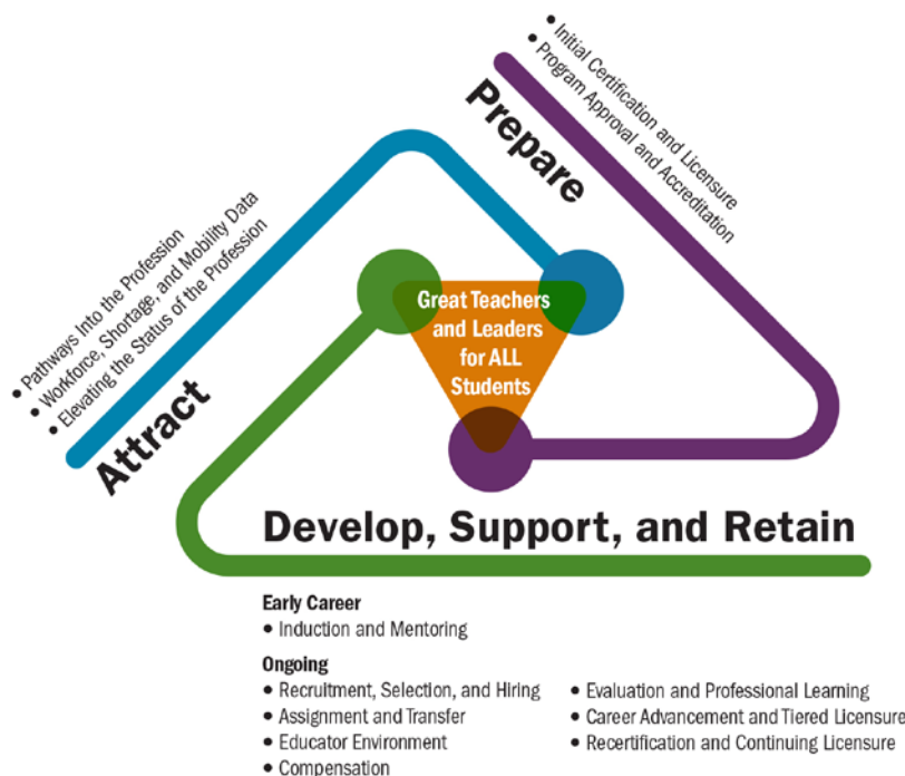
Figure 2. Talent Development Framework

The GTL Center’s Talent Development Framework can help SBEs and SEAs move past piecemeal policies to create a coherent and aligned system to develop and support excellent teachers and leaders. Figure 2 identifies the various components of educator effectiveness included in the GTL Center’s Framework. This resource describes how states can create coherent policies to prepare, attract, develop, support, and retain excellent educators. The GTL Center offers a range of technical assistance services to support states in using the framework.